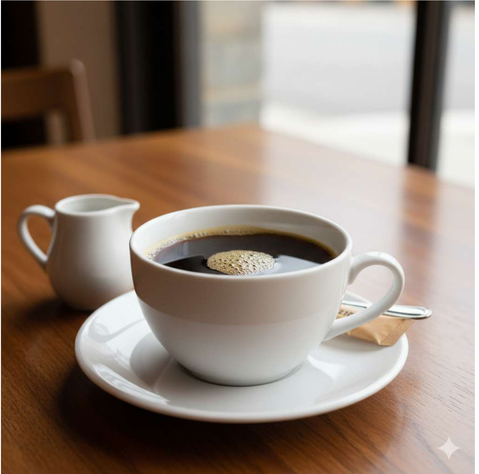
Coffee With milk. $ 3.50