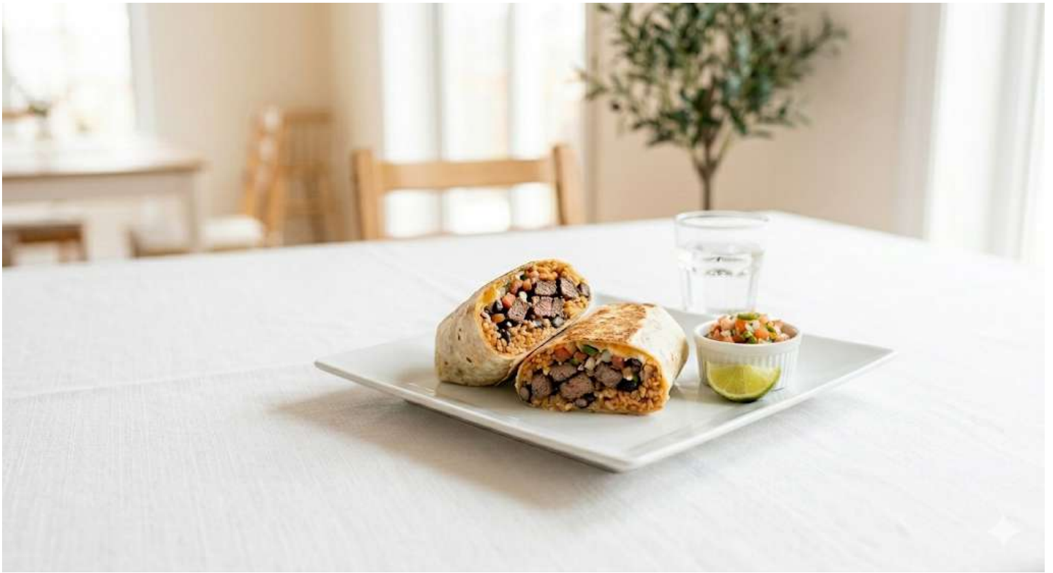
Wraps — $15.50 Your choice of Grilled or Crispy Chicken