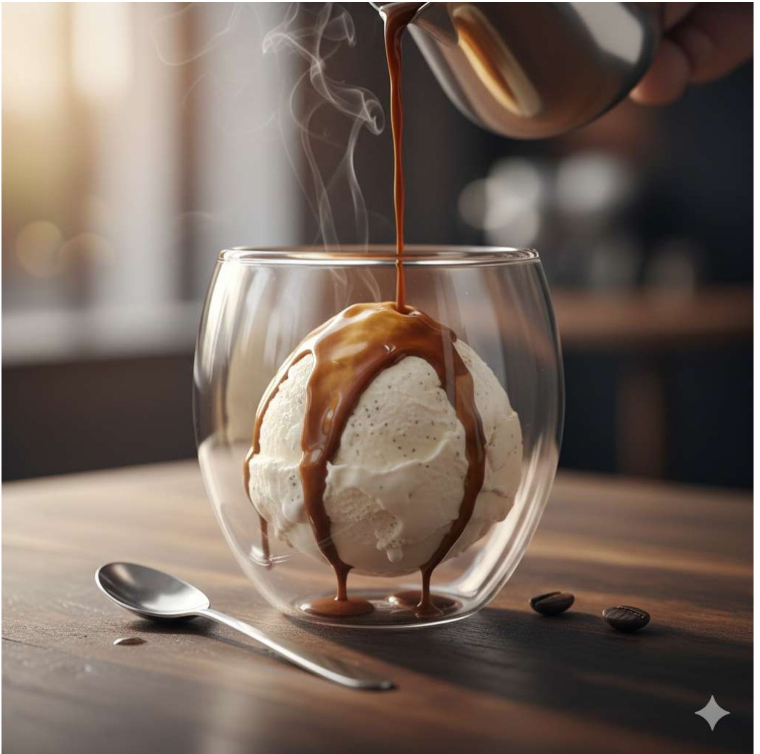
iced caramel. Macchiato. )$6.50