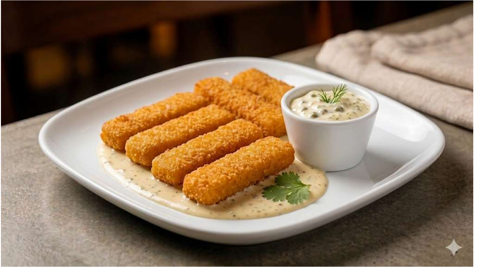
Breaded Shrimp — $9.50 6 pieces