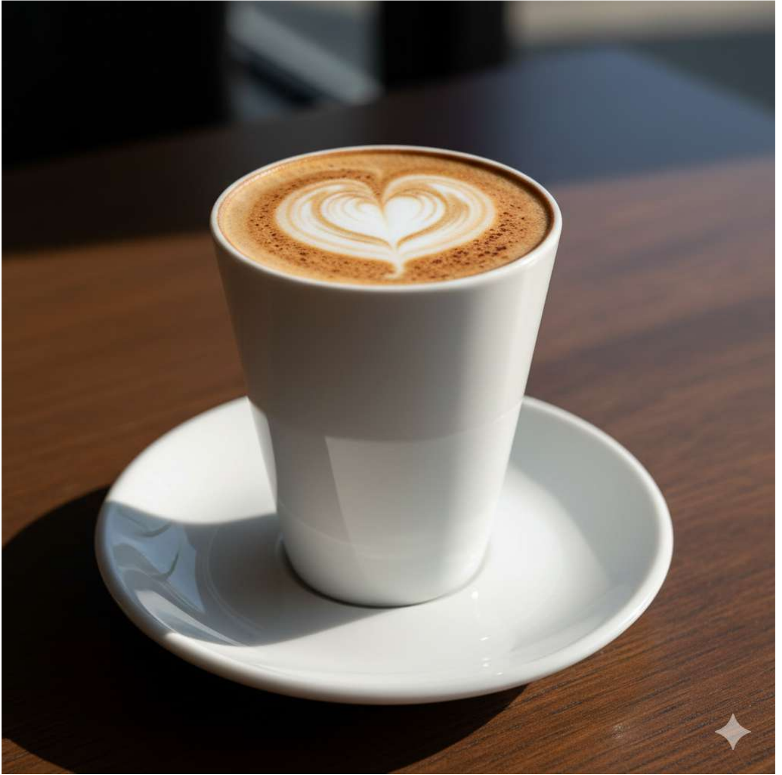
( latte Coffee ).$6.00