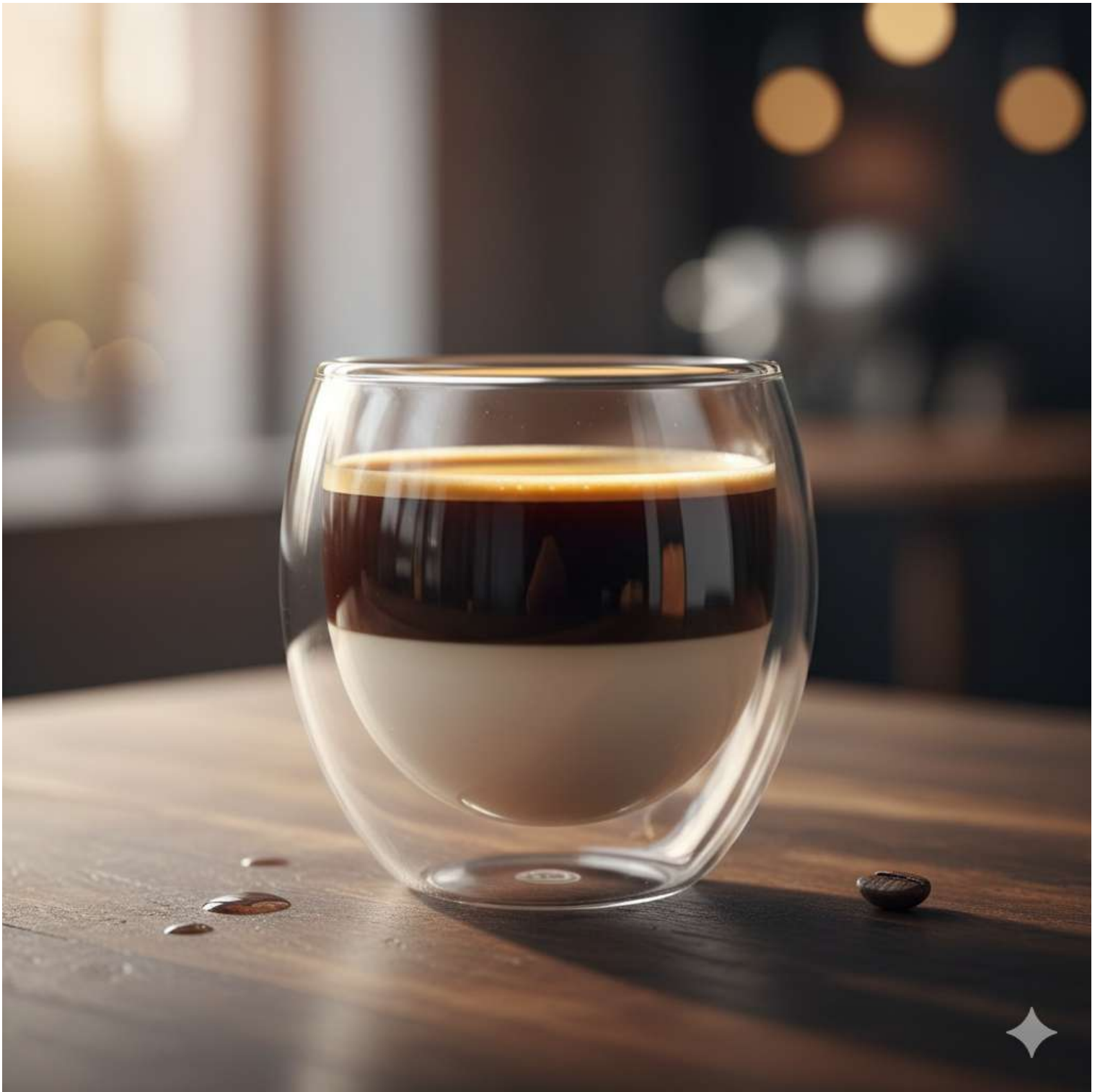
( Afogato. ). Coffee With ice Cream. $7.75