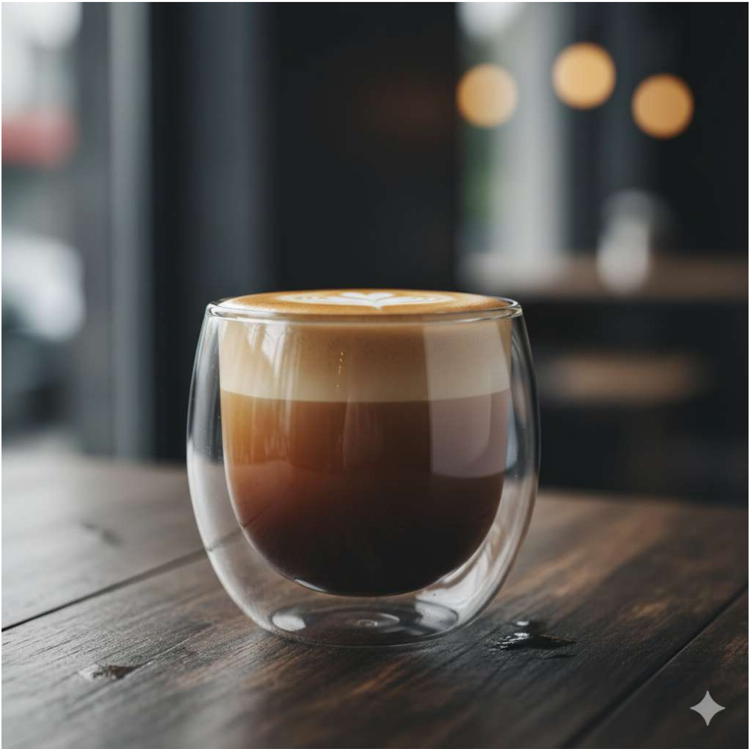
Italian capuchino ).$5.75