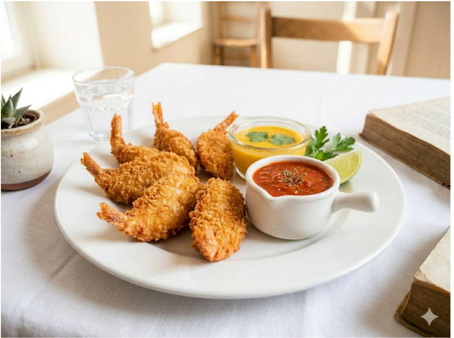
Fried Pork Chunks with Casava Bread — $13.95